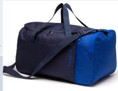
Decathlon Sporttas Kipsta 35 liter € 9,99